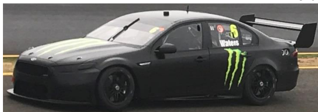
#6 Cam Waters - Monster Energy (Tickford Racing)