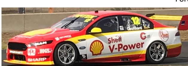
#12 Fabian Coulthard - Shell V-Power Racing Team (DJR Penske)