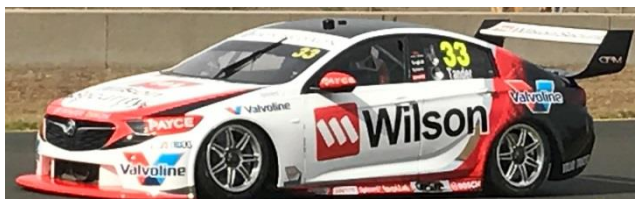
#33 Garth Tander - Wilson Security Racing (Garry Rogers Motorsport)