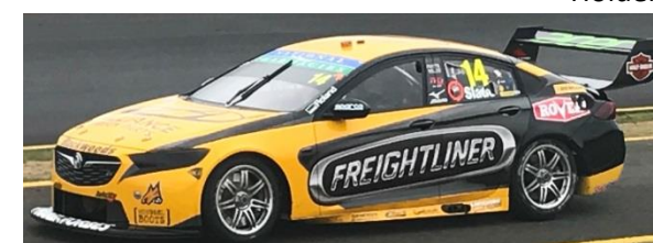
#14 Tim Slade - Freightliner Racing (Brad Jones Racing)

This poster is possible with thanks to the sponsors of the A.S.R.C.C.: