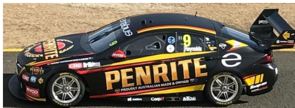
#9 David Reynolds - Penrite (Erebus Motorsport)