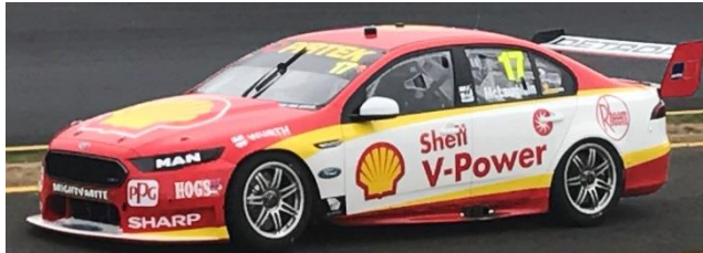
#17 Scott McLaughlin - Shell V-Power Racing Team (DJR Penske)