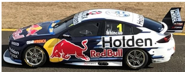
#1 Jamie Whincup - Red Bull Holden Racing Team (Triple Eight)