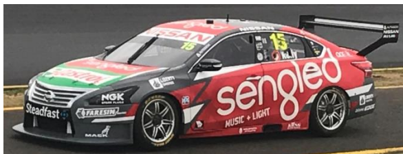
#15 Rick Kelly - Nissan Motorsport (Nissan Motorsport)