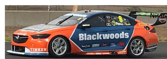
#8 Nick Percat - Blackwoods (Brad Jones Racing)