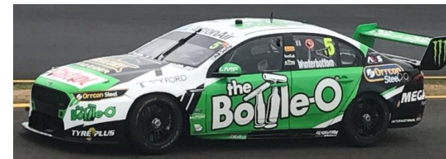
#5 Mark Winterbottom - The Bottle-O (Tickford Racing)