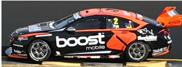
#2 Scott Pye - Mobil 1 Boost Mobile Racing (Walkinshaw Andretti United)